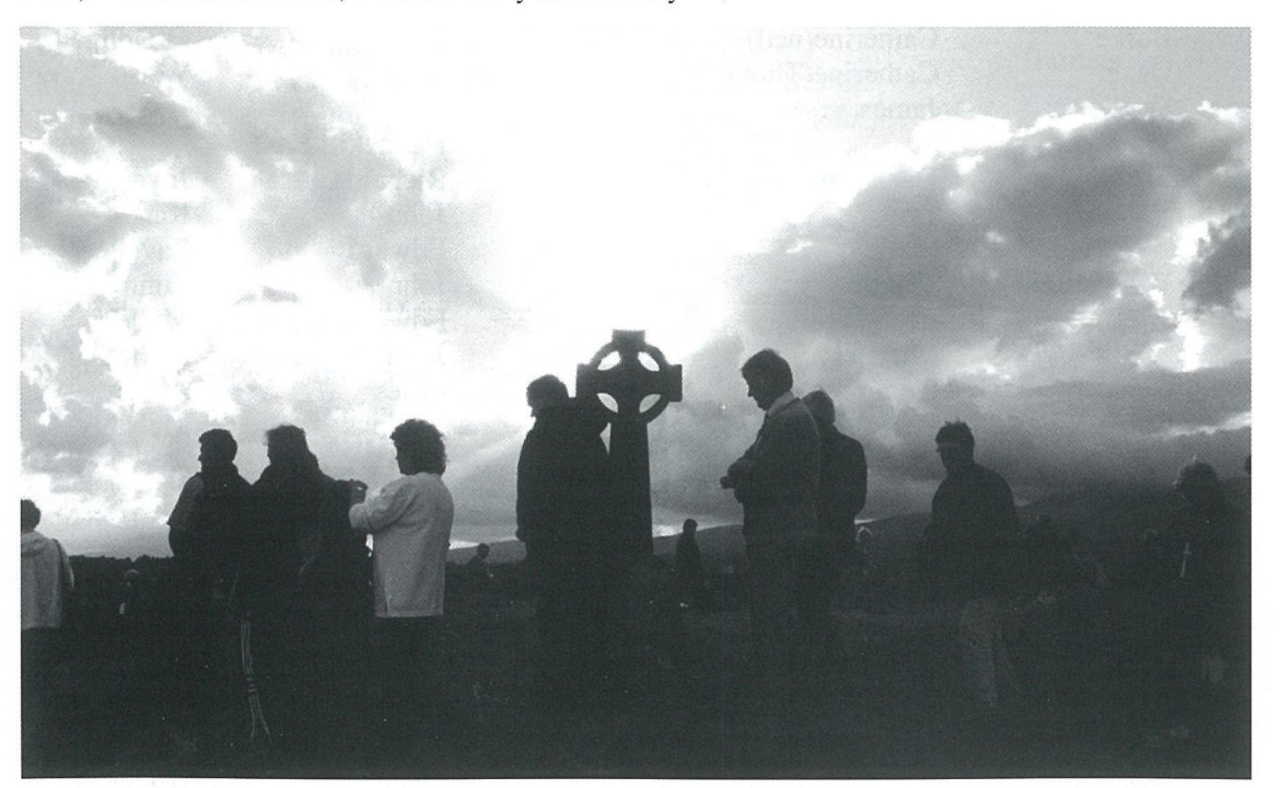
Taken 8th August 2000 at St. Dominick's Well, Kiltarnet. Reviving devotion to Holy Places.